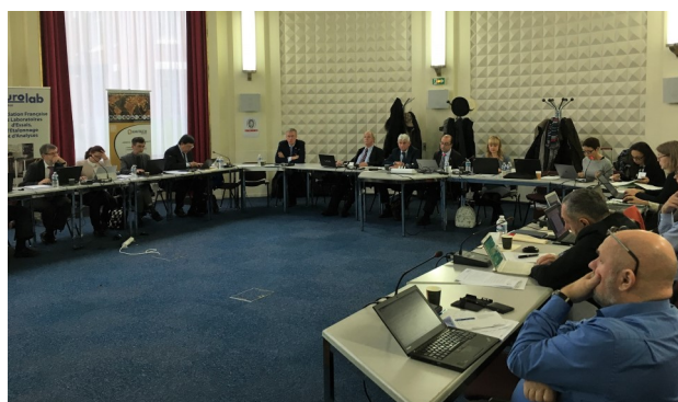
EUROLAB National Members' Meeting, 17 November 2017