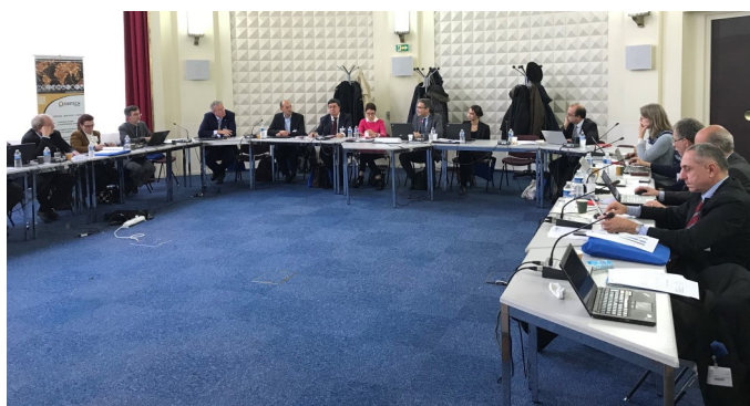
EUROLAB TCQA Meeting, 16 November 2017